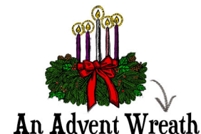
An Advent Wreath